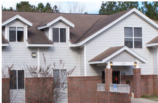
LSNF Tallahassee Office

Our board is comprised of representatives of the various attorney groups throughout our region and one third is comprised of client members, who represent various agencies serving the poverty community.