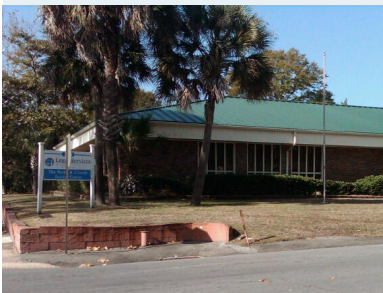
Panama City Office