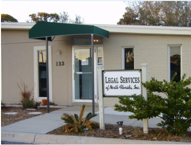
Fort Walton Beach Office