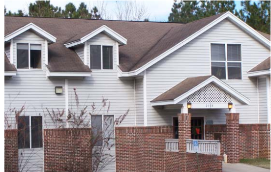
LSNF Tallahassee Office

Over the 16 counties we serve, we have 17 staff and over 300 volunteer lawyers.